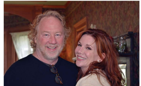
Books, Bites and Bids Special Guests: Tim Busfield and Melissa Gilbert

It would be wonderful if libraries had all the money they needed to operate and to be innovative; however reality is that many public libraries struggle to balance their budgets and to keep up with rising costs of materials, staff and technology. The East Lansing Public Library (ELPL) is no exception to this, and this is why ELPL holds our annual fundraiser, Books, Bites and Bids, every April.