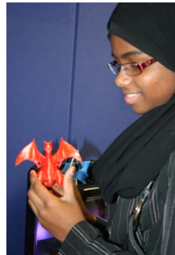
Patron examines article made by 3D printer

"They will allow for creation, experimentation and directed instruction and will enable us to address the five focus areas (Collaborate, Community, Develop, Discover and Learn) of the library's 2014-2017 strategic plan," she said.