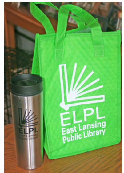
Purchasing Friends merchandise helps the library