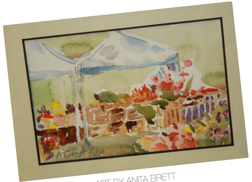
ART BY ANITA BRETT

There are several openings for upcoming month-long displays. Contact Schmidt at 517-899-5905 to apply.